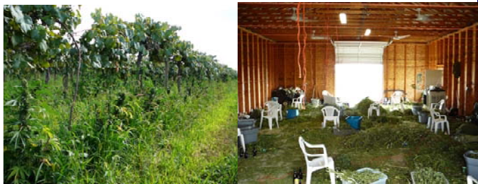
Operation Green Jam: Left Photo - Marijuana growing beneath a grape canopy. Right Photo - Marijuana processing room.

DEA and LEAD continue to work cooperatively on Operation Green Jam, which targeted an international drug trafficking organization that used vineyards as canopies for their outdoor marijuana grow operations. Approximately 146 suspects have been identified, 65 individuals have been arrested with more arrests anticipated in the future. This drug trafficking organization operates in Texas, Georgia, California, Missouri, Minnesota, and Wisconsin. Thus far, a total of 26 search warrants have been executed, 44 tons of marijuana have been confiscated, along with quantities of packaged marijuana, cocaine, methamphetamine, and firearms.