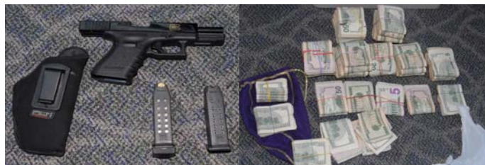
Operation GreenTree: Firearms and money seizures.

MDMA tablets. SCRTF also seized $512,762; 23 real properties with a net equity of $1.32 million, 30 vehicles, 4 boats, 4 All Terrain Vehicles (ATV) and 2 tractors. The total value all seizures is estimated at $2.43 million. Operation GreenTree had a significant impact on the availability of marijuana in the area. After the takedown, task force officers received reports that there was no marijuana available for purchase.