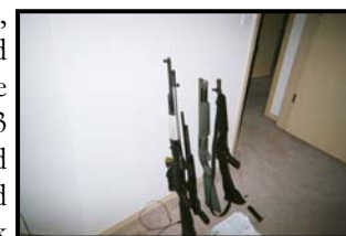
Operation "Ben Franklin"

A two week operation named "Ben Franklin" targeting street and mid-level drug traffickers operating in the HIDTA counties of Franklin and Benton was completed on January 27, 2006. The operation resulted in the identification of 45 suspects and closure of 25 drug distribution houses. Over half of the suspects had prior criminal records for drug trafficking and the drug trafficking activity of the suspects also involved the commission of other offenses such as burglary and assault. In addition to the seizure of methamphetamine, cocaine, crack cocaine, marijuana and oxycodone, 12 firearms (see photo), 8 vehicles and $12,573 in cash was seized. Agents and officers from the DEA-led Yakima Valley Drug Task Forces, the Tri-City Metro Drug Task Force, ATF, US Marshals,